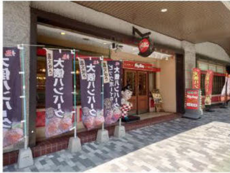
1F, Big Boy (Steaks)

Next 2 Neighboring Stations: Shiminhiroba and Minatojima