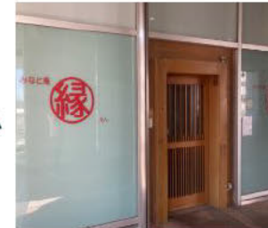
2F, みなと庵縁 *Closed on Saturday