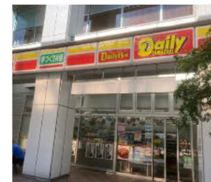
1F, Convenience Store