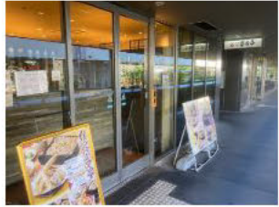
2F, Restaurant Kazokutei Port Island *Closed on Saturday