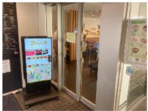
2F, Restaurant Compass