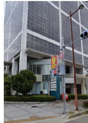
In this building