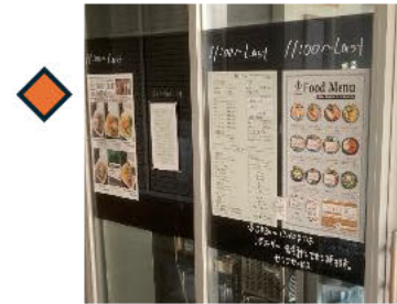
1F, Kitchen & Coffee matros