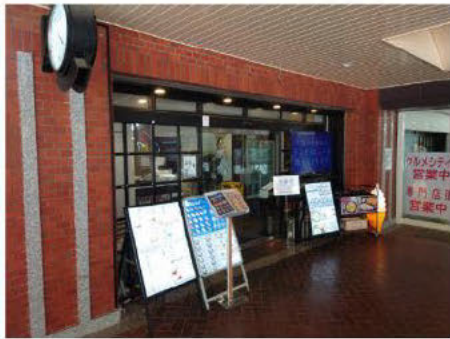
1F, ごはん家 (Japanese food)