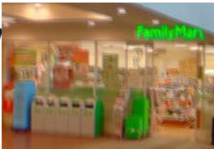
1F, Convenience Store (Inside of hospital building)