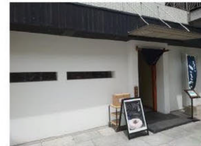
1F, うどんのことは (Udon noodle)

Note that there are several restraints in the “Kobe Portopia Hotel” and “Ariston Hotel Kobe”, but they are little expensive.