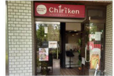
1F, Chiriken (Chinese food)